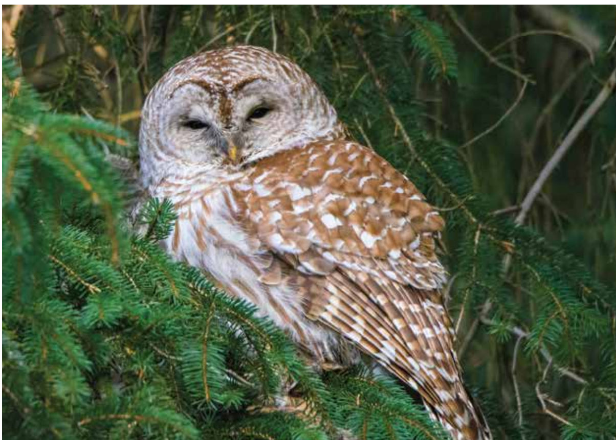
▲ Barred Owl: "Silent Guard of the Forest"