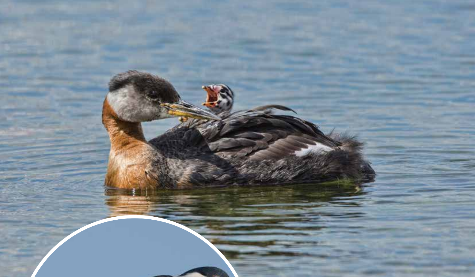
▲ Red-necked Grebe: "Proud Mama"