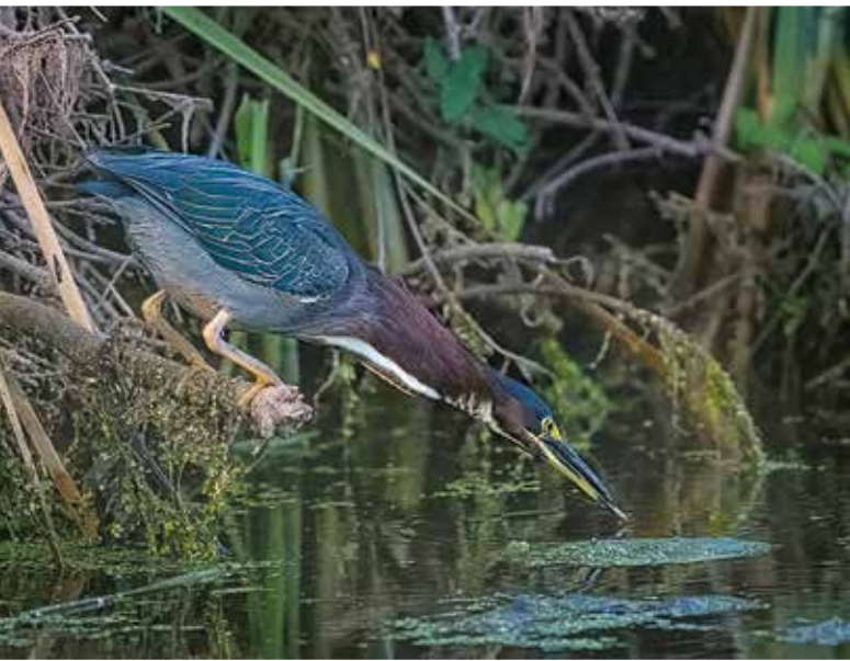
▲ Green Heron: "Patience has its rewards"