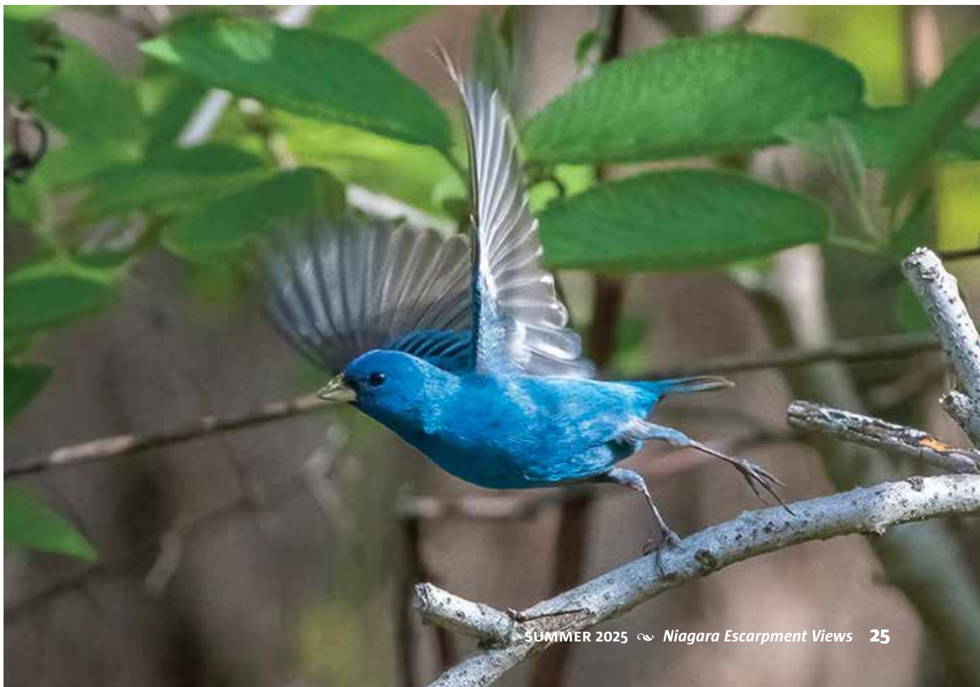
► Indigo Bunting: "Time to Go"