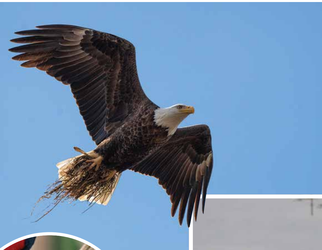
◀ Bald Eagle: "A Home in the Making"