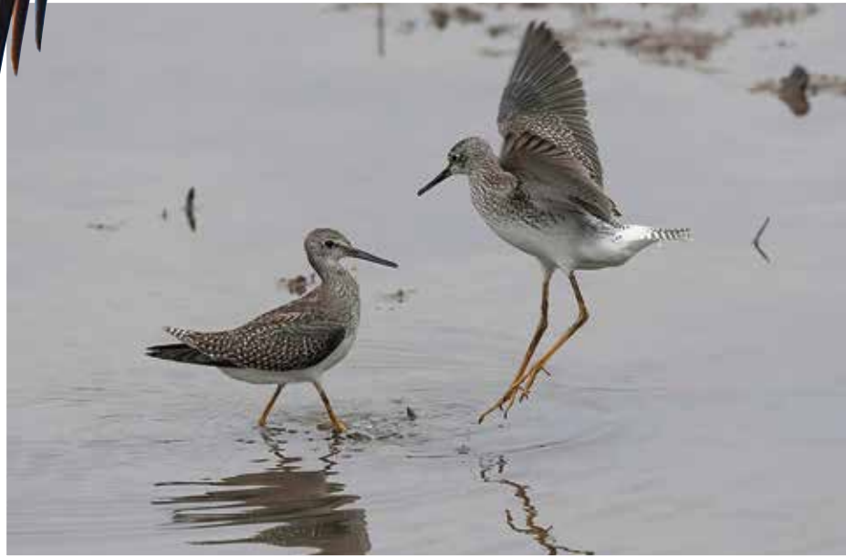
▲ Lesser Yellow Legs: "Playing in the Pond"