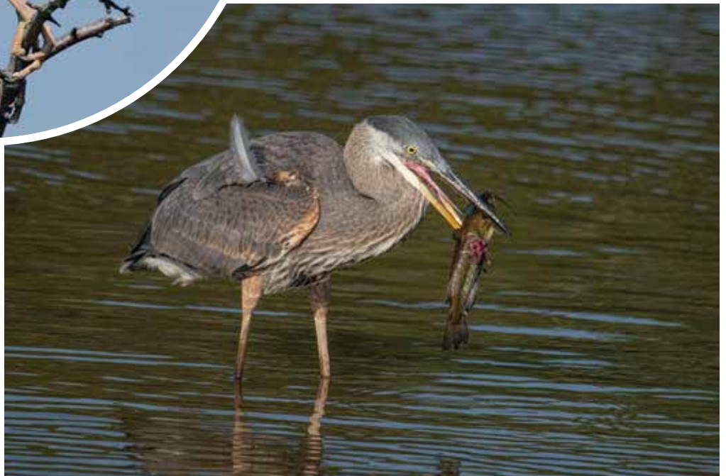
▼ Great Blue Heron: "Lunchtime Success"

My current photography gear for birding is a mirrorless, full-frame Nikon Z6iii camera. The lenses that I primarily use, are a 180-600mm zoom lens or the 500 PF prime lens with a teleconverter. These lenses allow me to take my photos from a distance as I do not want to disturb the birds. I prefer to shoot without the use of a tripod so I am free to move around to track the bird. The setting I like to use is a fast shutter speed of 1/2500, f8 aperture, auto ISO, and a High Frame Rate.