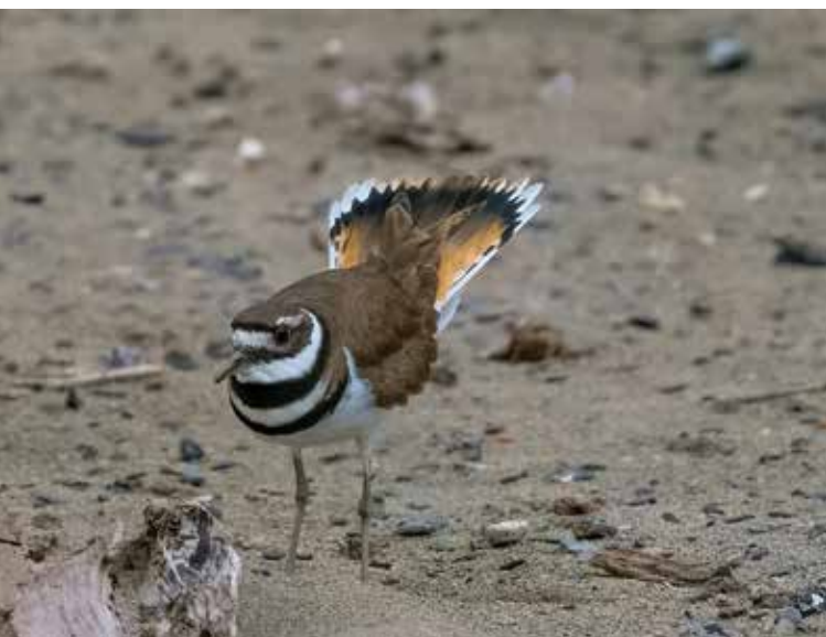
▲ Killdeer: "Beach Stop Over"