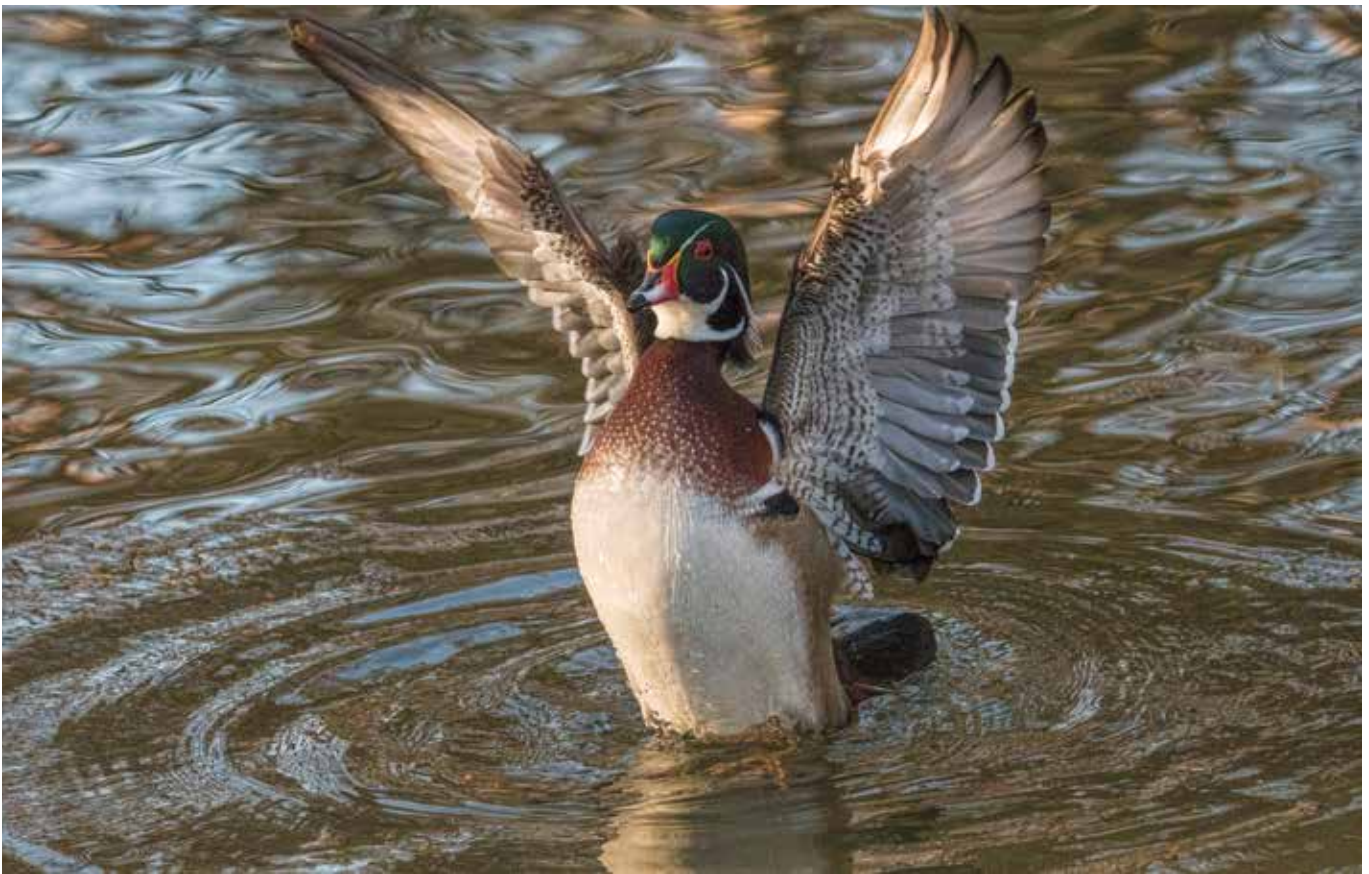
▲ Wood Duck: "Flapping"