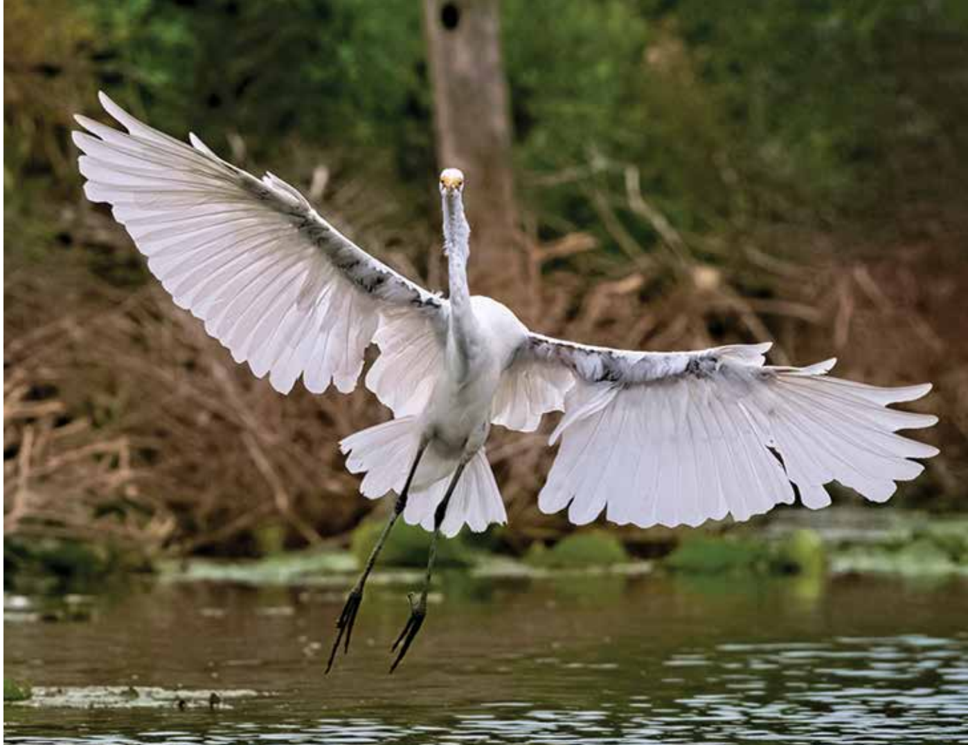
▲ Egret: "Splashdown: Landing in Style"