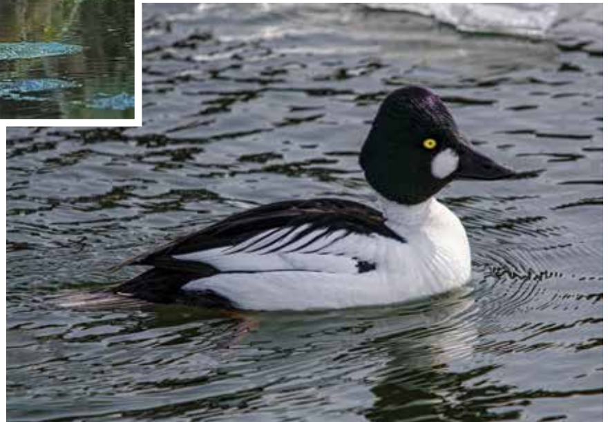
▼ Common Goldeneye: "Peaceful swim on a glorious day"