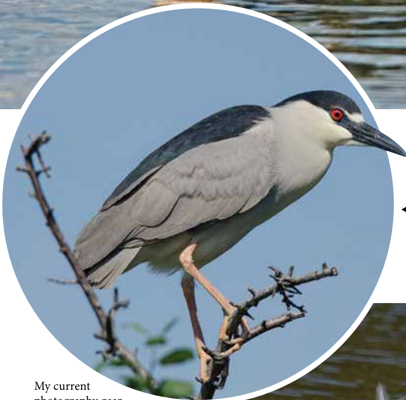
◀ Black-crowned Night Heron: "Warmed by the Sun"