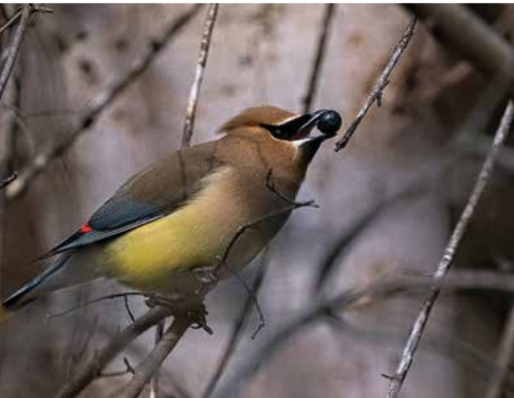
▲ Cedar Waxwing: "Berry-licious!"