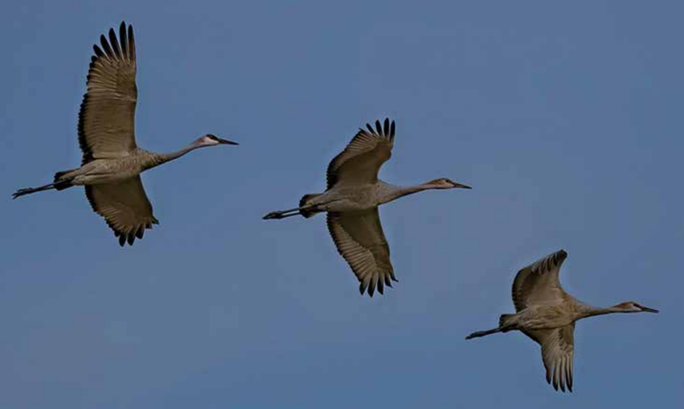
▲ Sandhill Cranes: "Triple Flight in Harmony"