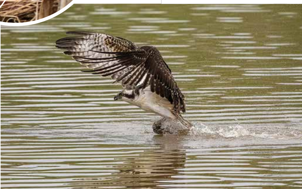
◀ Osprey: "Hunter's Reward"