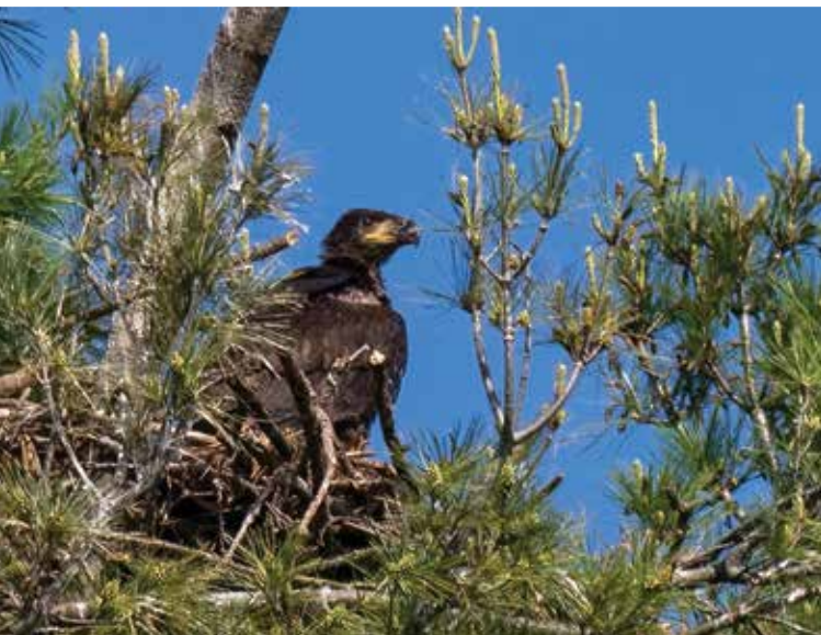
▲ Juvenile Bald Eagle: "What is Out There?"